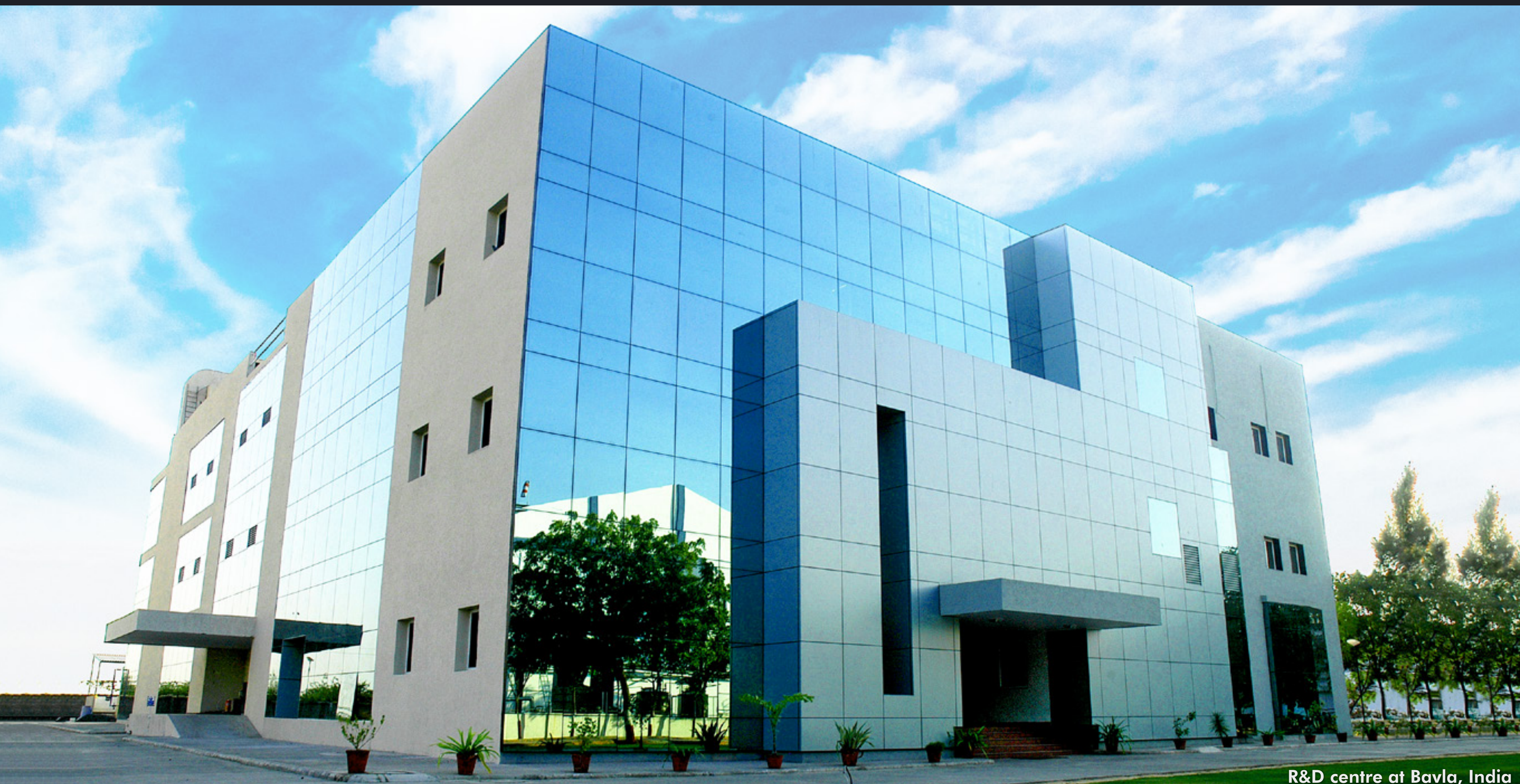
R&D centre at Bavla, India